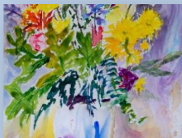
Jane Byers, artist

The perfect gift for a relative, a garden lover friend, hostess, or someone who just needs cheering up.