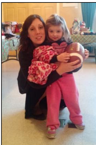
CEA Toy Shop 2015